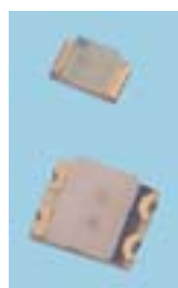
L=3.2, W=1.6, D=1.1